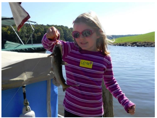
During our final Fish for Fun lesson on October 11th, first-time Kid Caster reeled in nine bream and this big catfish to win a silver fish medallion in the 2015 TUFF Derby Youth/ Catfish category!