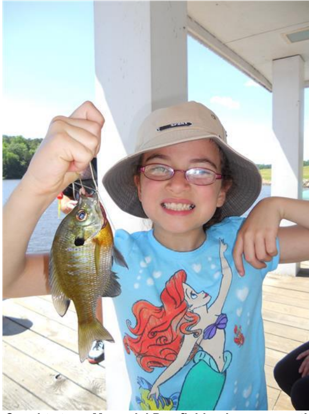
Caught at our Memorial Day fishing lesson event!