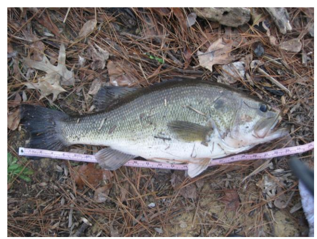
TUFF Director Libby took advantage of the warm weather on December 15 and was tossing night crawlers on ultra-light tackle. Fishing from the shore at Hidden Lake marina, she was enjoying an amazing blitz from 3 to 5pm with a bite on practically every cast including a 16 inch bass and this 23 inch by 16.5 inch, seven pound, five ounce largemouth!