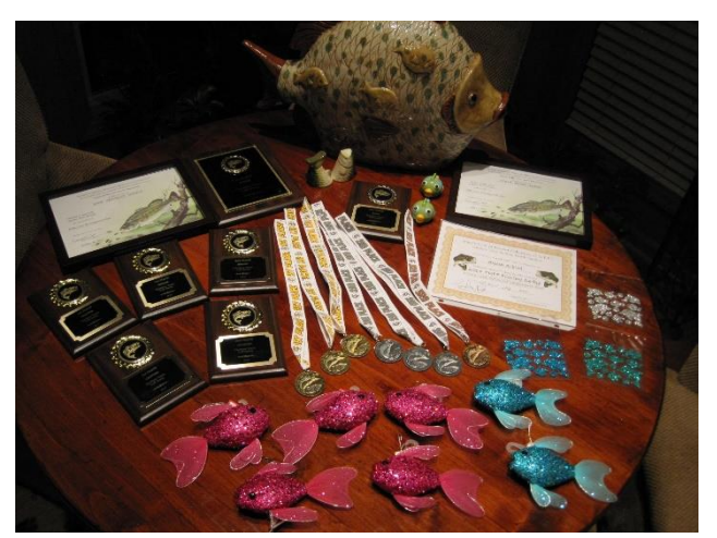
Adults get fish medallion plaques and State or TUFF Certificates; Children get really nice (heavy) gold or silver fish medallions plus gift bags with fish ornaments and fish stickers. A new BASS trophy plaque was introduced this year!